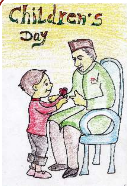
Akshitha III Std.